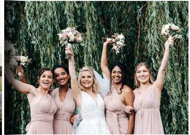
A Day at Deer Park Hall